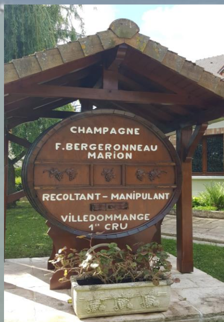
Champagne wine cellar

Information : +33 (0) 673-208-413 or : contact@transportsetdecouvertes.com